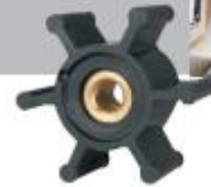
Impeller (3.1") 80 mm