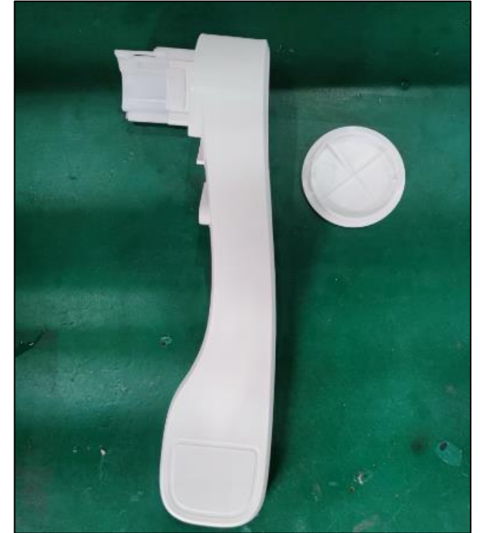
Accessories: Pedal kit