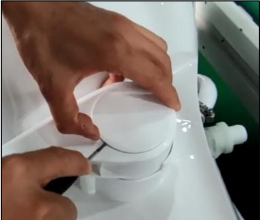
Step 1: Place the toilet down on the table, use a small screwdriver, insert into the gap of the side cover, and open up the side cover