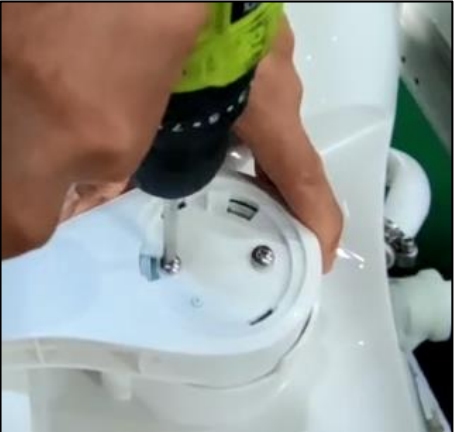
Step 3: Use a cross-head hand drill to loosen the two fixing screws of pedal kit, and take off the screws.