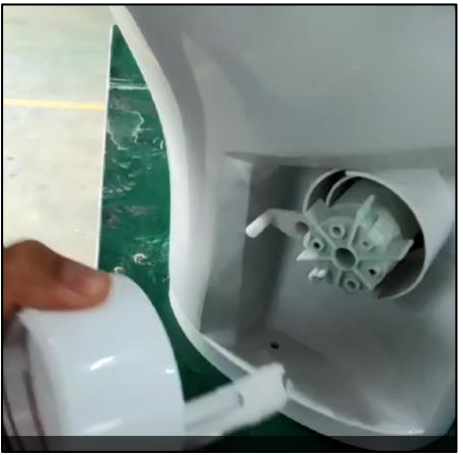
Step 6: After the pedal is loosened, take out the pedal kit