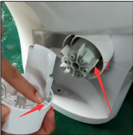
Step 1: Hold the new pedal kit, align pedal slot 1 and the part 2, as above