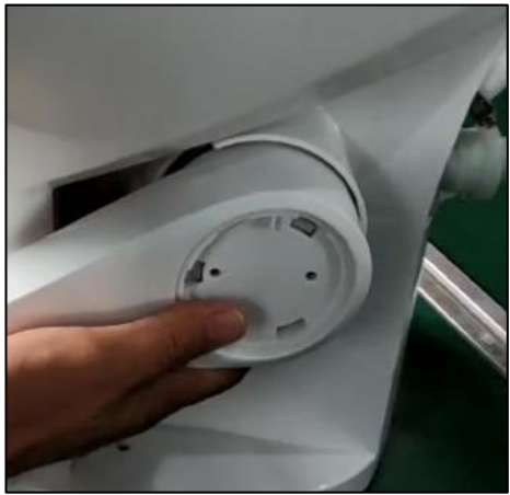
Step 4: Check whether the pedal kit matches the toilet base after installation