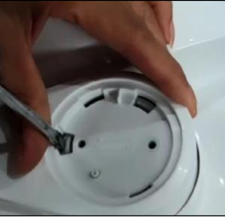
Step 4: Use a flat-blade screwdriver to insert the buckle, pry inward until the buckle is detached (there are two places)