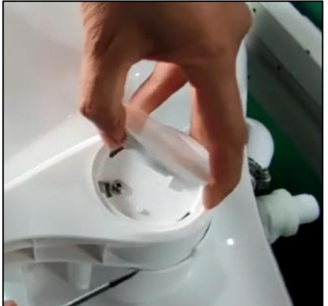
Step 2: After prying up the side cover, take out the side cover.