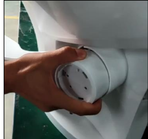
Step 5: Grasp the pedal and shake it outward to loosen the pedal.