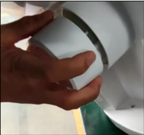
Step 2: After aligning the mark in step 1, insert the pedal kit.