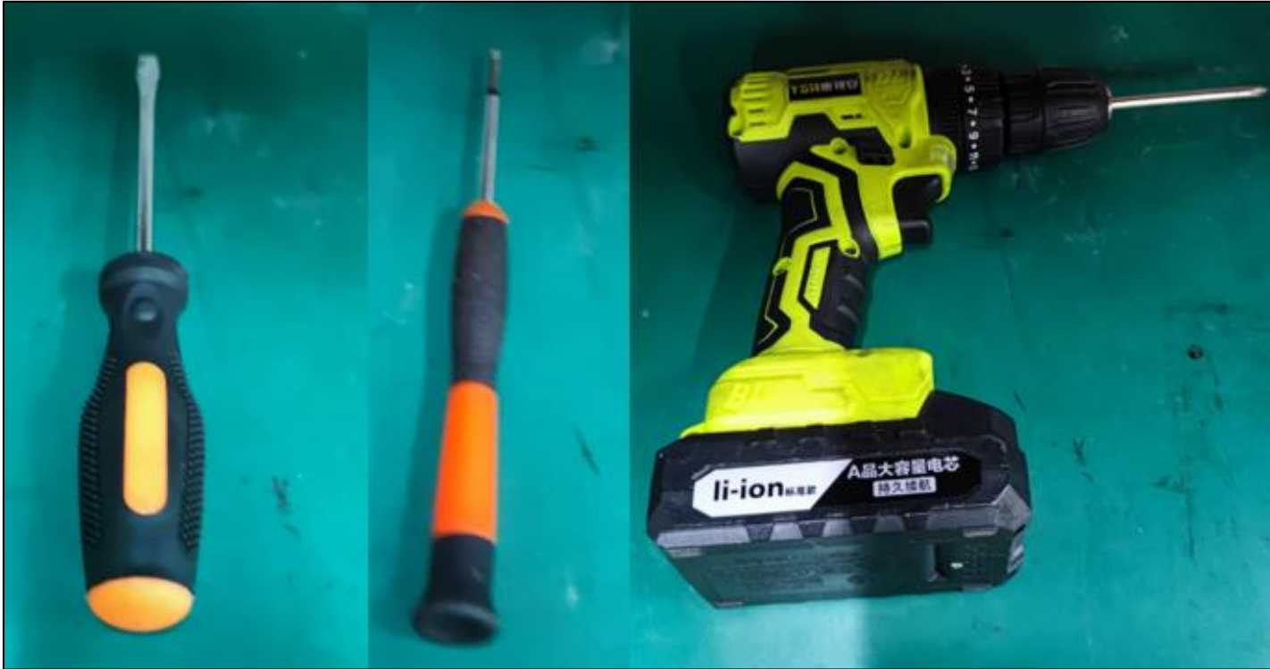
Tools: 2 slotted screwdriver (one big and one small), 1 Cross head hand drill