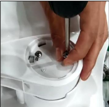
Step 5: Use a cross-head hand drill to tighten the pedal fixing screws (torque 18~20KG)